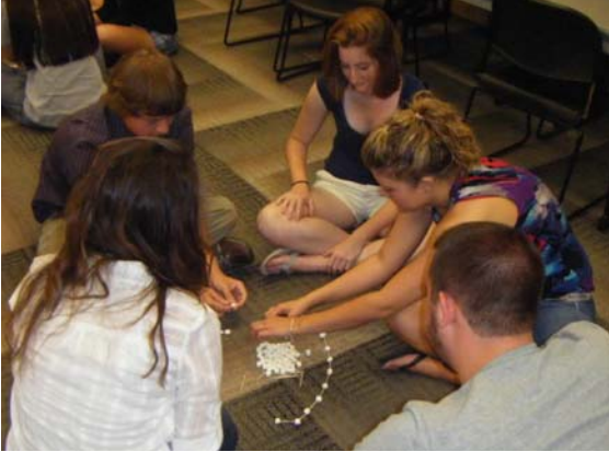
Building an eye with marshmallows and toothpicks