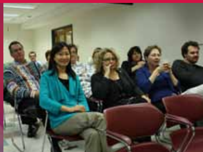
Myers Lecture Series pg. 14