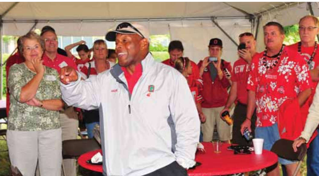
Archie addressing the crowd.