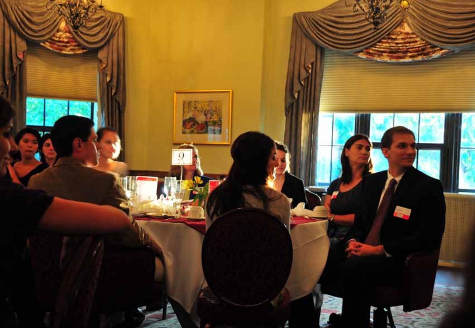
Class of 2015 at the Welcome Dinner