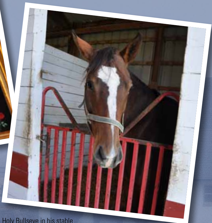
Holy Bullseye in his stable