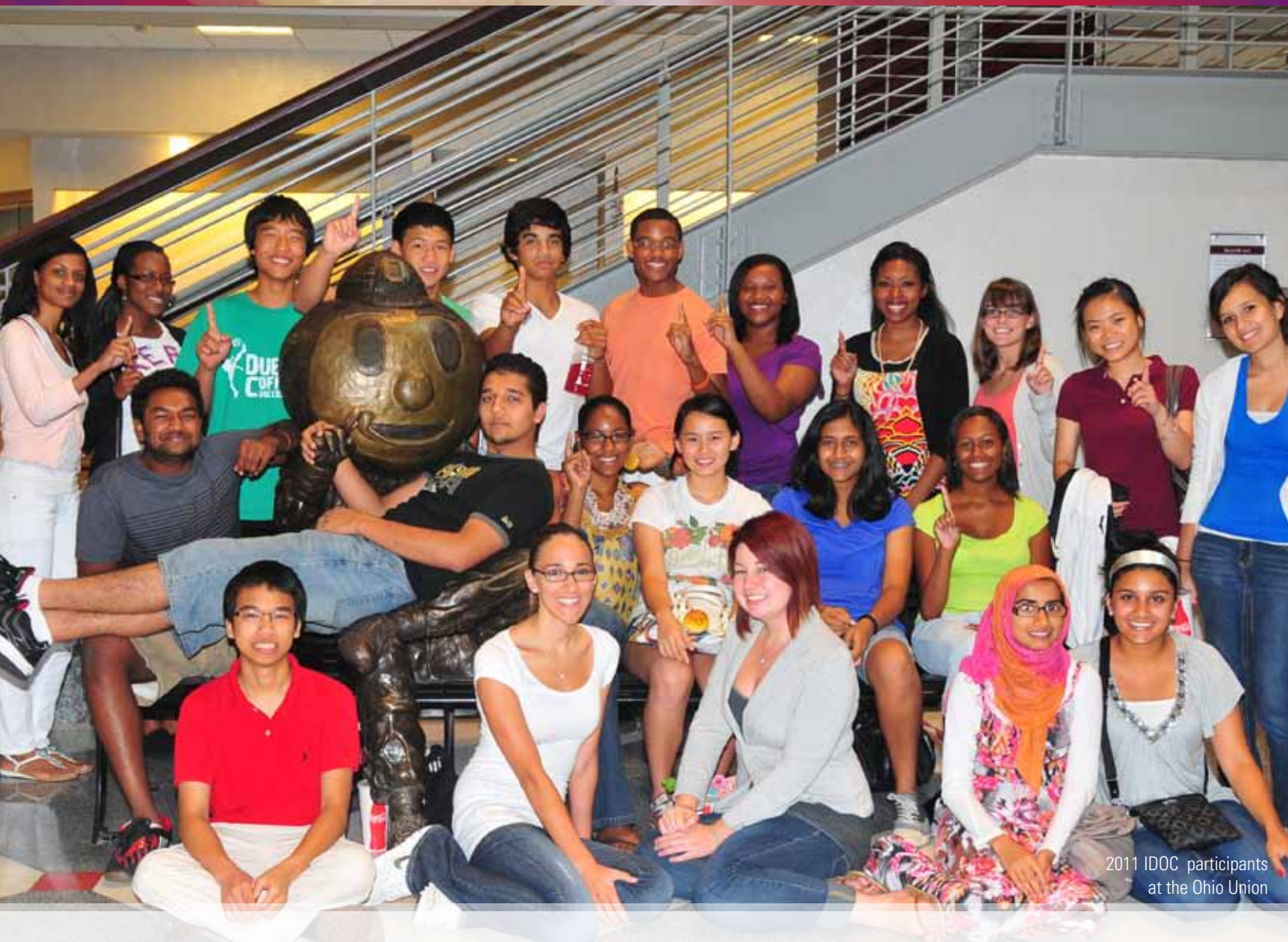
2011 IDOC participants at the Ohio Union