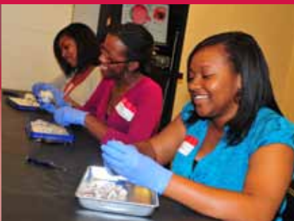
IDOC pg. 12