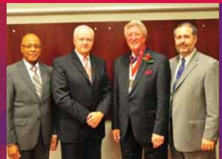
Augsburger Alumni Award pg. 26